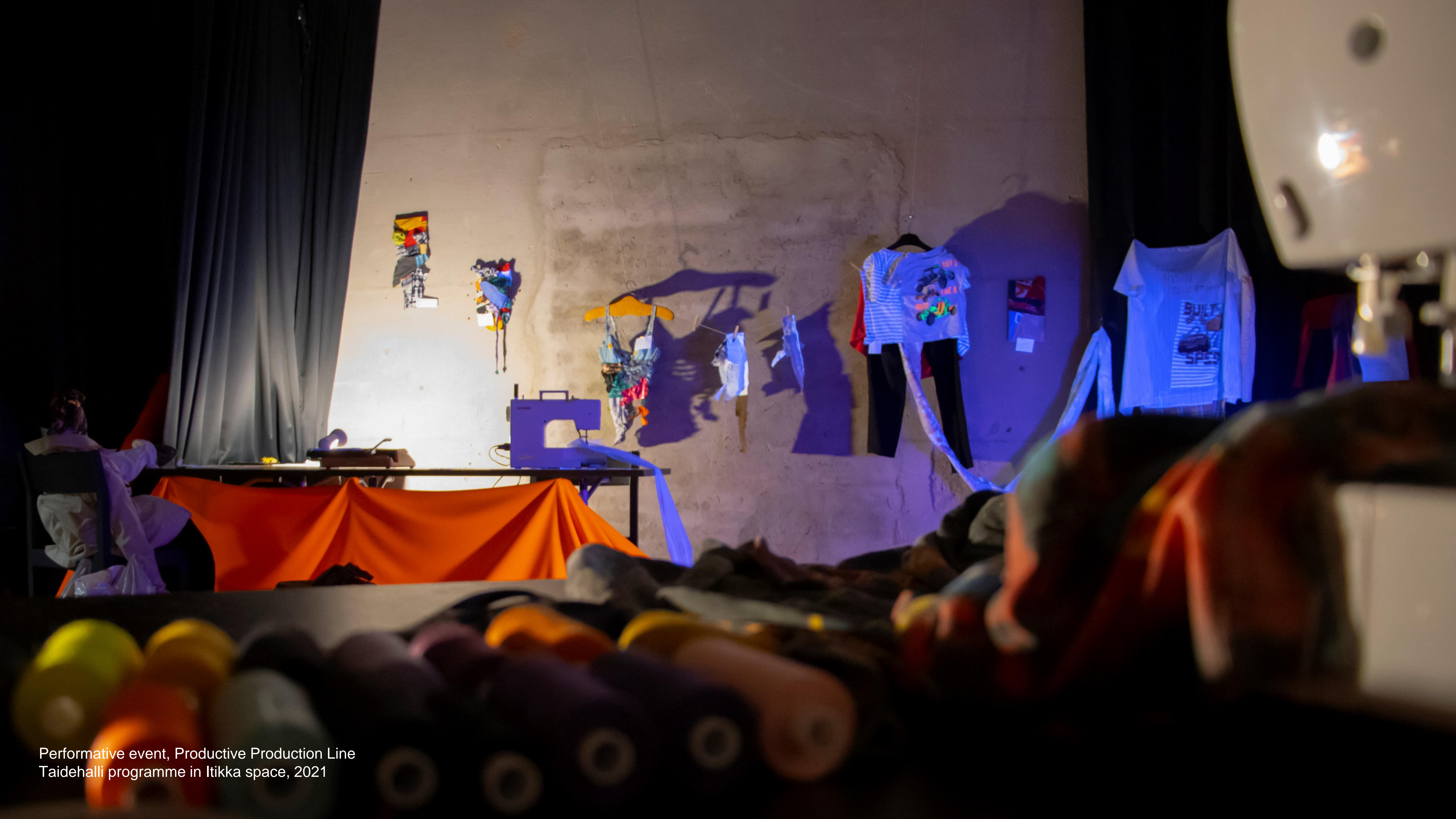
Performative event, Productive Production Line Taidehalli programme in Itikka space, 2021