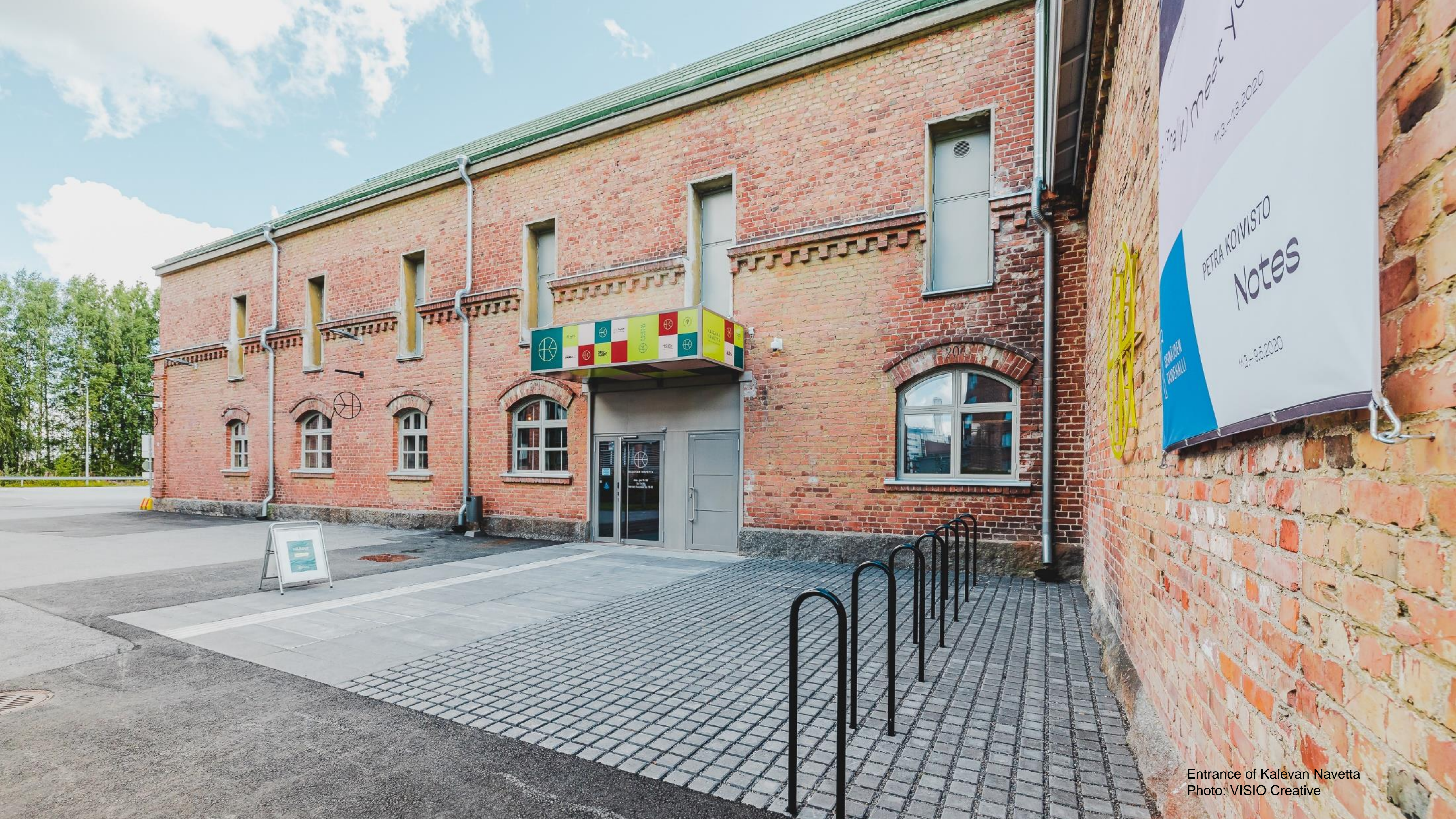
Entrance of Kalevan Navetta