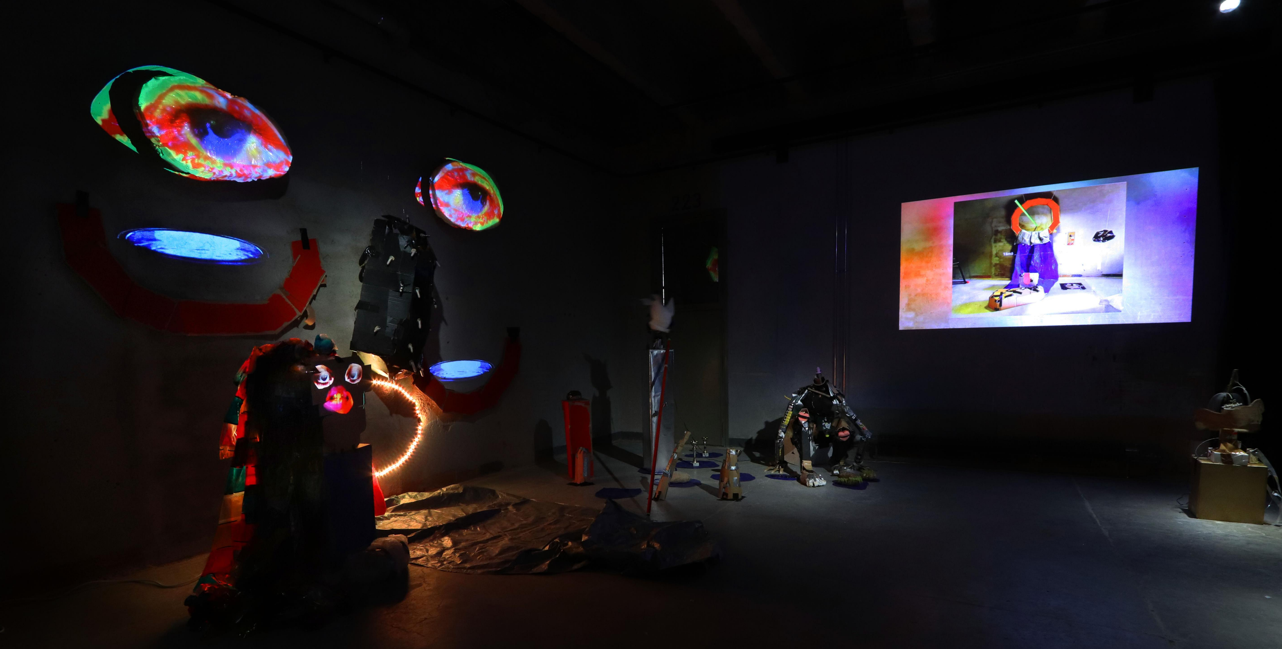
Summer Artist 2020 Sofi Häkkinen Serendipity –process based work in Itikka space